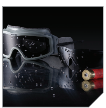
ESS Ballistic Protection ESS' extra-thick Polycarbonate lenses resist impacts—in this case blasts from a 12-gauge shotgun firing #6-shot from 10 meters—dimpling but not penetrating the lenses