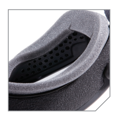
Striketeam SJ<sup>™</sup> Soft wicking face padding & fully-sealed vents