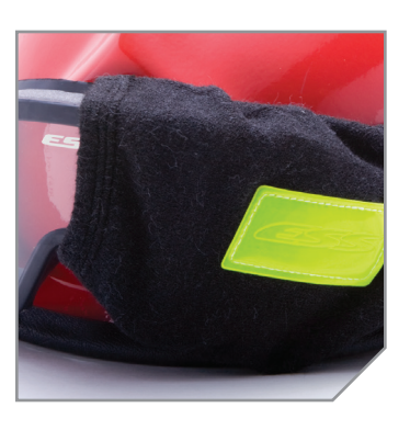
Nomex<sup>®</sup> HeatSleeve<sup>™</sup> Optional protection for goggle & lens, guards against scratches & heat