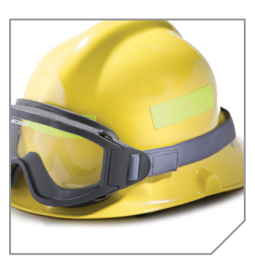
Strap System 2 Velcro® tabs secure strap to any type of helmet. Goggles can be stowed on front of helmet